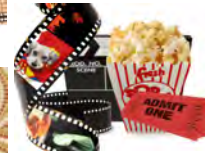
Crocodile Dundee The Man from Snowy River Crocodile Hunter