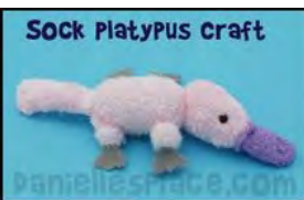
Sock Platypus craft