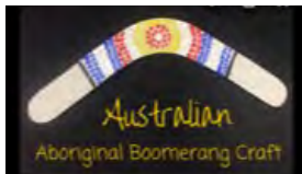
Boomerang Making Platypus Craft

If its winter in north America that means it's summer down under. Come enjoy dinner and activities with an Australian flair. We'll have a BBQ dinner, watch Australian themed movies, have some of Australia's favorite snacks and make some fun Australian crafts. We'll also have your favorites games, hair and nail bar and the cooking class.