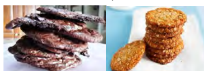
Chocolate Crackle Anzac Biscuits